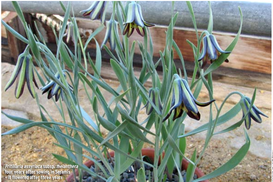
Fritillaria assyriaca subsp. melanthera four years after sowing in Seramis - it flowered after three years