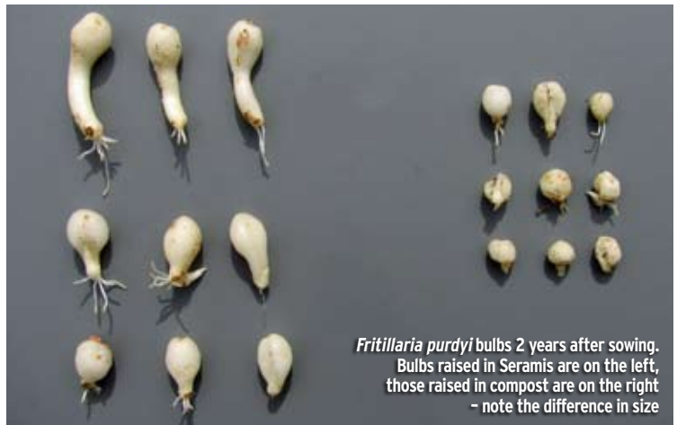
Fritillaria purdyi bulbs 2 years after sowing. Bulbs raised in Seramis are on the left, those raised in compost are on the right - note the difference in size

titanium compounds. The clay becomes reddish-brown in the firing process as the iron oxidizes.