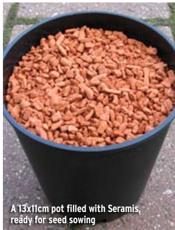
A 13x11cm pot filled with Seramis, ready for seed sowing